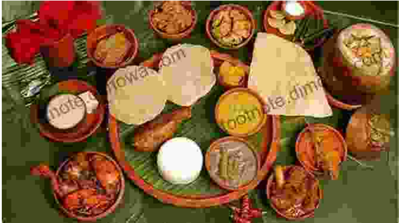
Contemporary Celebrations: A Blend of Heritage and Modernity

While Pohela Boishakh remains rooted in tradition, contemporary celebrations have incorporated new elements that reflect the changing times. In urban areas, cultural organizations host music and dance performances, art exhibitions, and literary events to mark the occasion.