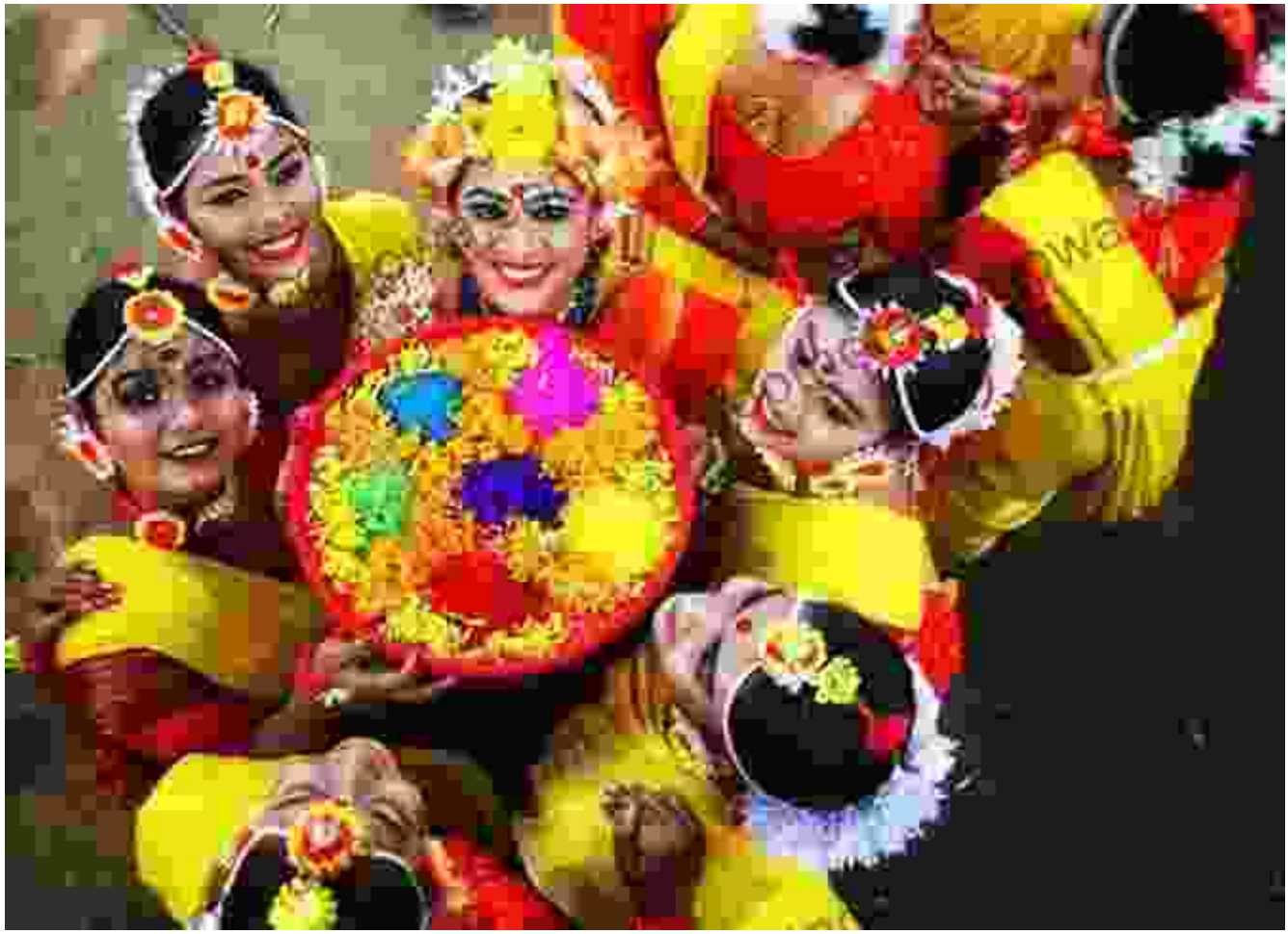
Mangal Shobhajatra: A Cultural Extravaganza

Another highlight of Pohela Boishakh is the Mangal Shobhajatra, a colorful procession that takes place in Dhaka, the capital city of Bangladesh. The procession features traditional music, dance, and vibrant costumes, showcasing the diversity and richness of Bangladeshi culture.